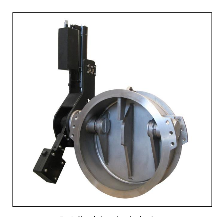
Fig. 1 Closed tilting disc check valve

ORBINOX RA check valves are double-eccentric wafer or flanged valves, both with cast body or fabricated body construction in sizes up to DN 2000 and for applications up to 25 bar. Our valves are designed for horizontal piping and vertical piping installations.